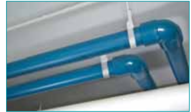
AquaRise is ideally suited for hot and cold potable water distribution through mains, laterals and risers.

Proven strength, competitive price, easy installation — what all this adds up to is significant time and cost-savings for contractors and building owners over the long term.