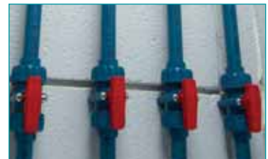
AquaRise is also ideal for smaller diameter plumbing applications including laterals, distribution lines and branch lines.