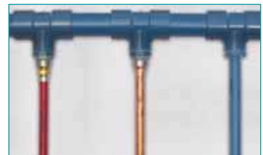
Transition fittings enable easy connections to other materials for greater job-site flexibility.

AquaRise interior & exterior walls remain smooth in any service condition, unlike metal which, over time, will rust, pit, scale & corrode.