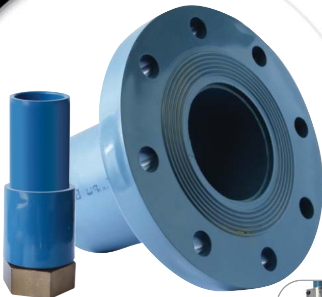
Spigot–Female Thread to Copper Transition

When used in conjunction with the AquaRise® Maintenance Couplings these pre-solvent welded assemblies provide a transition to copper to complete the necessary repairs. Although we encourage AquaRise product to be used in AquaRise system repairs – this repair method can get your system back up and running without needing to account for solvent cement cure times in your repair schedule.